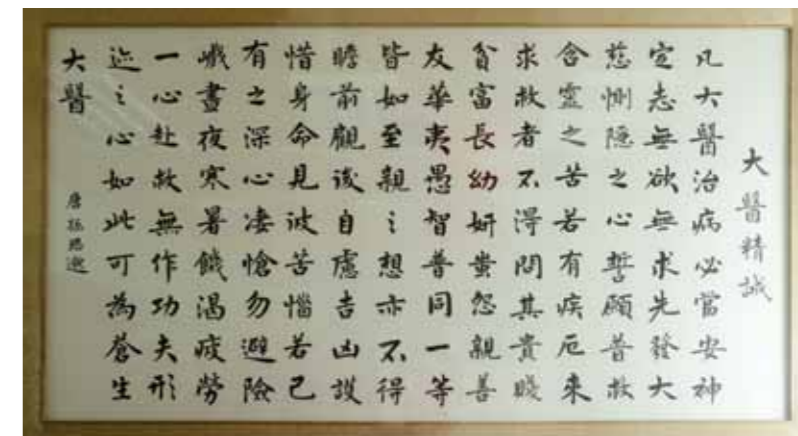
Clockwise from top: Ethics literature Virtual of a great physician ; Tak Sing Tong's logo.

If you have a friend or family member suffering from cancer, you'll be sure to know it causes great distress to the cancer patients and their family.