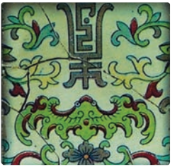
Clockwise from above left: The Chinese lattice window has been upcycled into a wall-mounted decoration; an Oriental-style design; Kelly Sou is in charge at W.H. Furniture

由於風格與一般家具店截然不同，榮興傢俬成功吸引到一批追求個性化的中產客戶。榮興傢俬不會就某個設計項目進行大量生產，因而讓產品保持獨特性，又相信只要透過不同質料的傢俬，便能體現出細膩的生活文化。展望將來，公司希望爭取更多本土人士對榮興傢俬的認同，為澳門開拓更廣的設計空間。 M