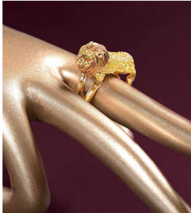
Top: Yong Li offers a variety of products to suit different needs.