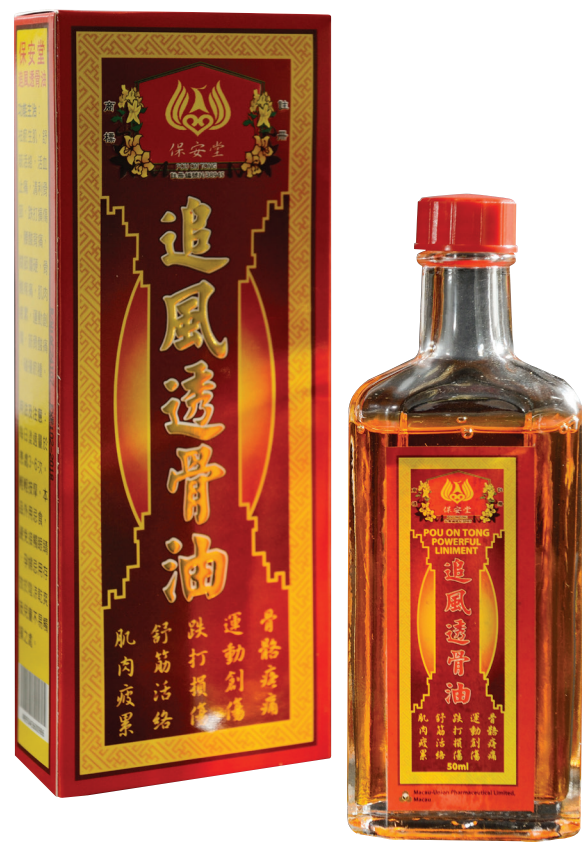
Above: The signature Far Reaching Medicated Oil, made by Pou On Tong, can alleviate bone pains, muscle soreness, joint stiffness and lumbago.

寶和堂大部分產品則採用中藥提取物取代直接使用中藥原材料，這種生產方法符合科學。除了可以保持相關的療效外，安全性亦更有保證。”